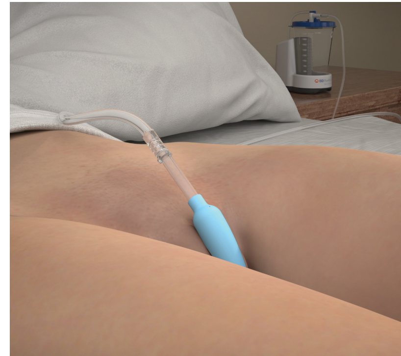
The PureWick™ Female External Catheter is placed between your legs in order to collect urine.