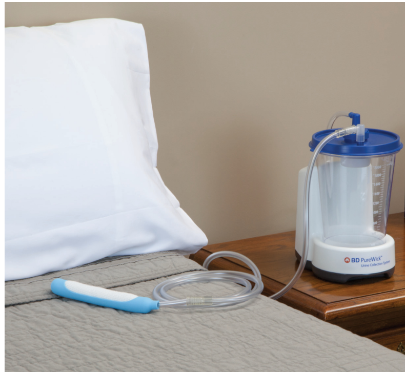
The PureWick™ Female External Catheter connects to the PureWick™ Urine Collection System.